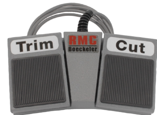
79883 - DUAL FOOTSWITCH CONTROL