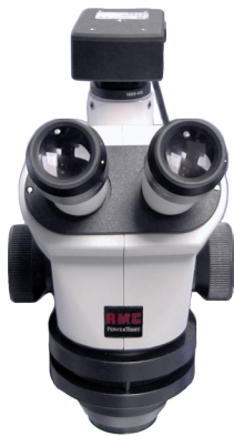
50611 - ZEISS 508 TRINOCULAR (FOR USE WITH CAMERA P/N 50549)