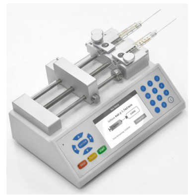
75370 -SP - AUTOMATED WATER SYSTEM (REQUIRES PTPCZ WITH VIDEO)