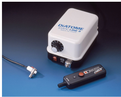
74800 - STATIC LINE IONIZER, 115VAC (P/N 74801 FOR 220-240VAC)