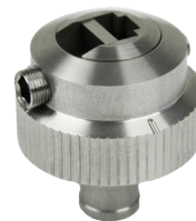
75368 - UNIVERSAL SPECIMEN HOLDER