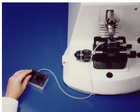
75370 - WATER TROUGH FILLER (PERISTALTIC WATER PUMP)